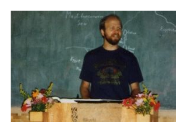
Preaching at our local church