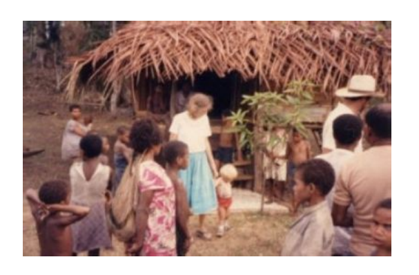
Even enjoyed living in the village during our orientation training