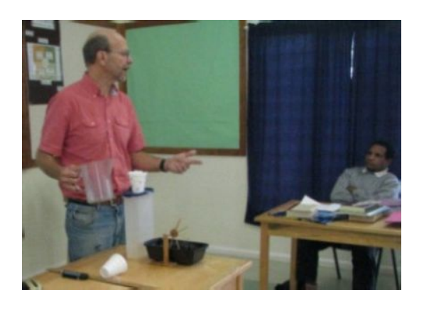
Consulting and teaching on computer and solar