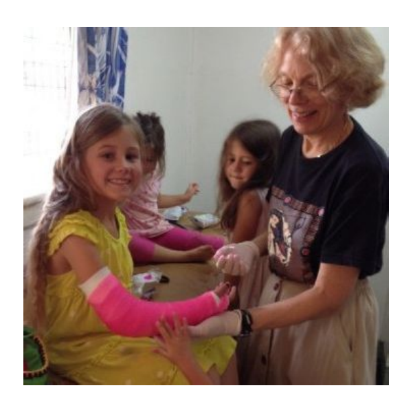
Caring for MK's and their families