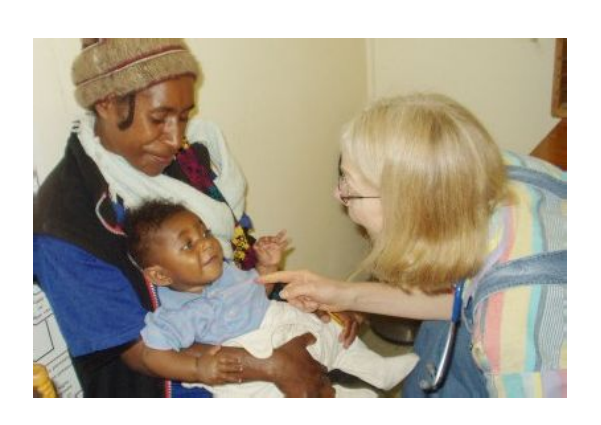
Making Babies Laugh