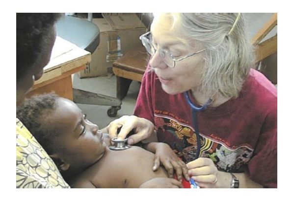
Caring for local kids