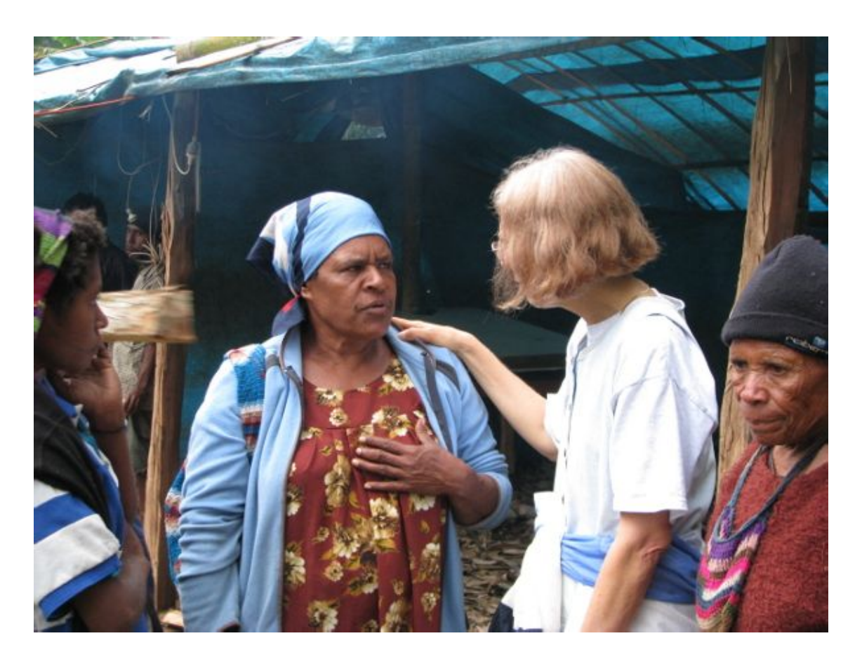
In fellowship with women in our local church; Comforting those with sad hearts.

Praise the Lord with us for 30 years of ministry and 30 years of His strength.