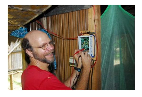
Village Solar projects