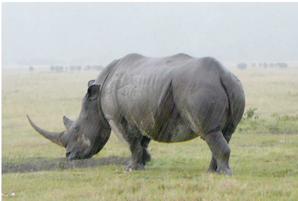
Black Rhino in a rain storm. Nakuru Lake National Park.

When all was done on the mission side of our work, Helen and I took a much needed holiday in the