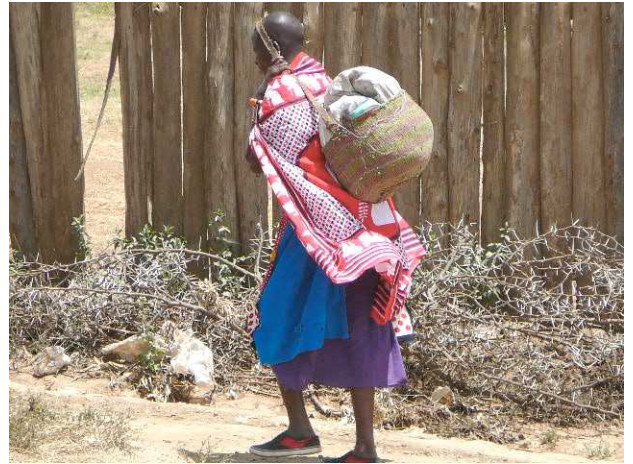
Colorful Masai woman on the way to work

Lake Nakuru and Masai Mara countryside. What an incredible experience seeing God's wonderful creation up close. Sometimes VERY close. If you wish to see it for yourself then please visit our web site for more pictures in our "Photo Gallery" section.